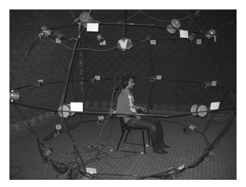
FIGURE 1: Anechoic room with loudspeaker setup and subject.

saved with the help of the electromagnetic tracking system. To make the direct comparison of real sources and binaural reproduction without moving headphones during the listening test possible, subjects also have to wear headphones during the HRTF measurement.